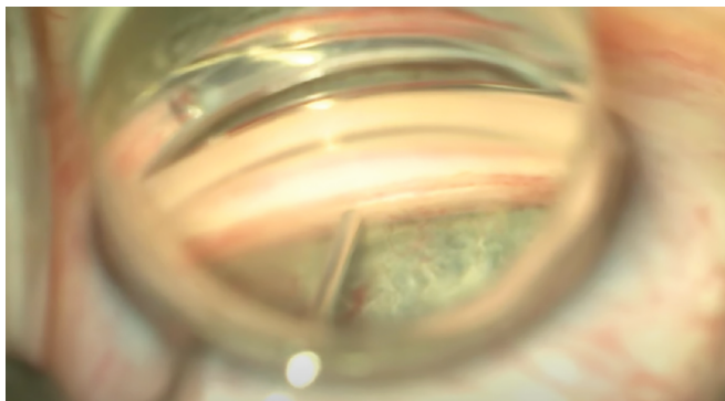
Fig. 2: Intraoperative gonio-photograph of the open angle after removal of the 10-0 Prolene suture

The primary outcome of this study was the success of the trabeculotomy, defined as an IOP \leq 18 mm Hg or \geq 20\% reduction in IOP compared to pretrabeculotomy measurements without any secondary surgical or laser intervention, and with the same or fewer NGM. The success of the procedure was defined by both an IOP target and an IOP percent reduction target to include patients who need better IOP control on fewer medications and patients with IOP above the target who need IOP reduction. An IOP of 18 mm Hg or below is deemed acceptable for preventing glaucoma progression for patients with mild disease, 12 and a 20% reduction after an IOP-lowering intervention is the recommended primary effectiveness endpoint by the United States Food and Drug Administration guidance for industry: premarket studies of implantable MIGS devices. These endpoints were also used in other studies investigating the efficacy of ab interno trabeculotomy postcanaloplasty. 13