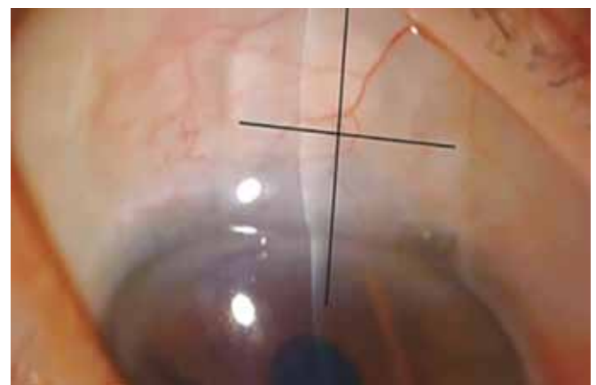
Fig. 2: Anterior segment optical coherence tomography scans were done through sagittal and transversal plans to the implant (as shown by lines)

Intraocular pressure and number of glaucoma medications were significantly reduced ( p < 0.05 ) from a preoperative value of 23.4 \pm 8.6 mm Hg ( n = 3.8 glaucoma medications) to a postoperative value of 6.0 \pm 2.5 ( n = 0 ), 10.6 \pm 5.4 ( n = 0 ), 13 \pm 1.6 ( n = 0.4 ), 12.4 \pm 2.1 ( n = 0.2 ) and 14.4 \pm 1.5 ( n = 0.2 ) at 1 day, 1 week, 1 month, 6 months and 1 year respectively (Table 2).